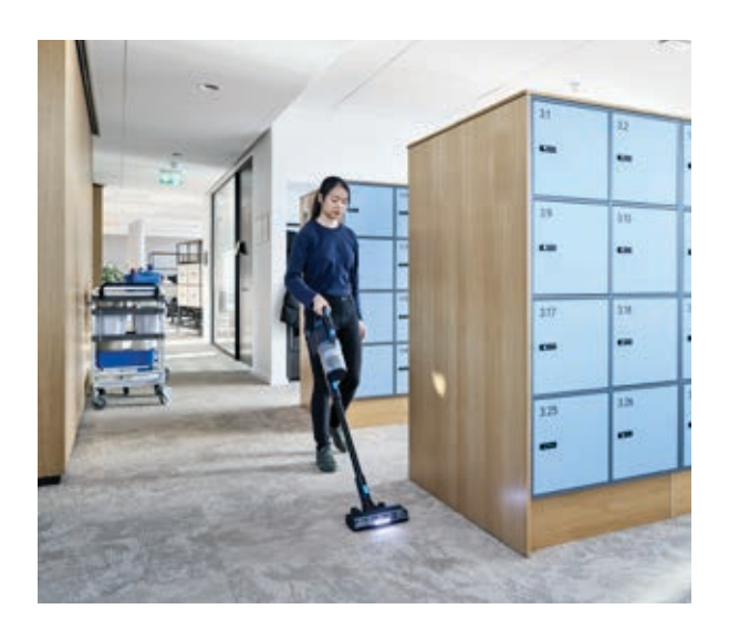
The prefilter for rough dust and the anti-allergy HEPA 14 filter retains 99.99% of airborne particles, ensuring a healthier and safer working environment.