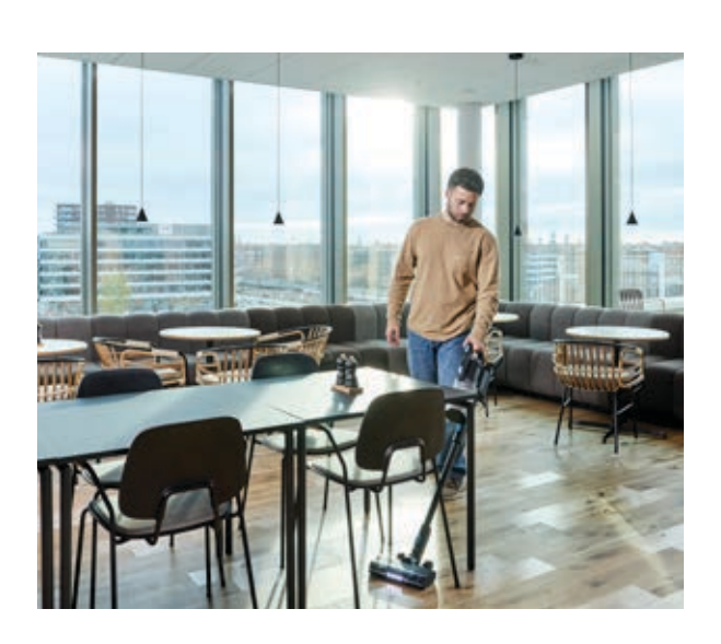
The ergonomic handle avoids injuries and strain, and the compact size and the slim accessories enable you to clean even hard-to-reach areas comfortably.