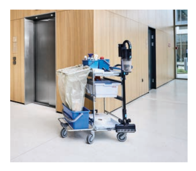
The mounting bracket makes this stick vacuum a part of your cleaning cart, enabling a smooth workflow.

Say hi to the VU200, our new cordless stick vacuum that lets you clean comfortably and quickly without interrupting your workflow. This tool does not mess around; it gets straight to business. Spot it, got it!