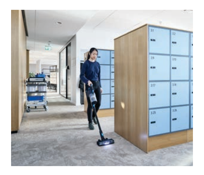
The prefilter for rough dust and the anti-allergy HEPA 14 filter retains 99.99% of airborne particles, ensuring a healthier and safer working environment.