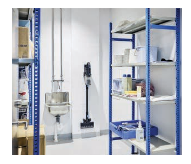
No plug or cord to trip over, this cordless vacuum stick runs on a Lithium battery – a battery and charger kit makes it easy to swap and recharge.